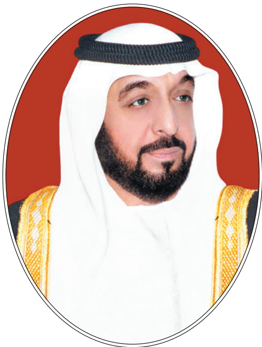
His Highness Sheikh Khalifa bin Zayed Al Nahyan, President of UAE