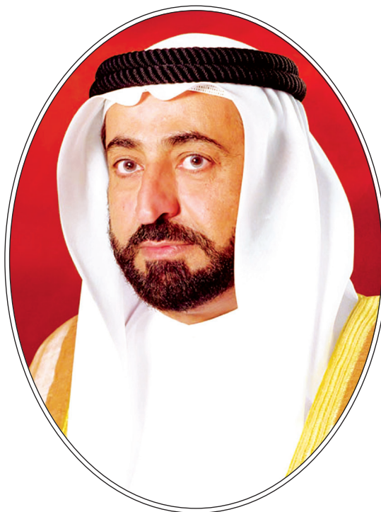
His Highness Sheikh Dr. Sultan Bin Mohammed Al Qassimi, Supreme Council Member & Ruler of Sharjah